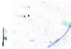
LOCATION MAP N.T.S.