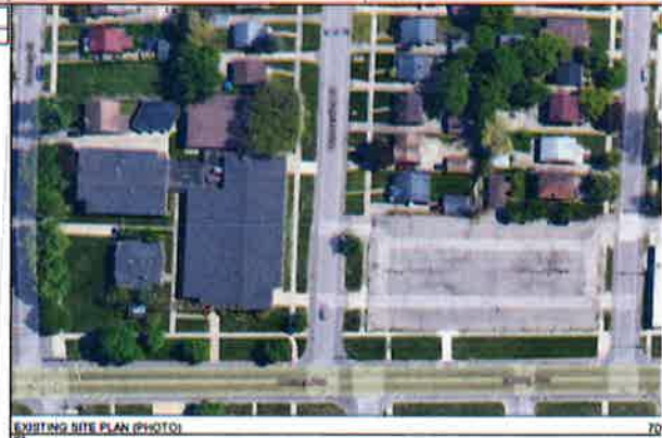
EXISTING SITE PLAN (PHOTO)