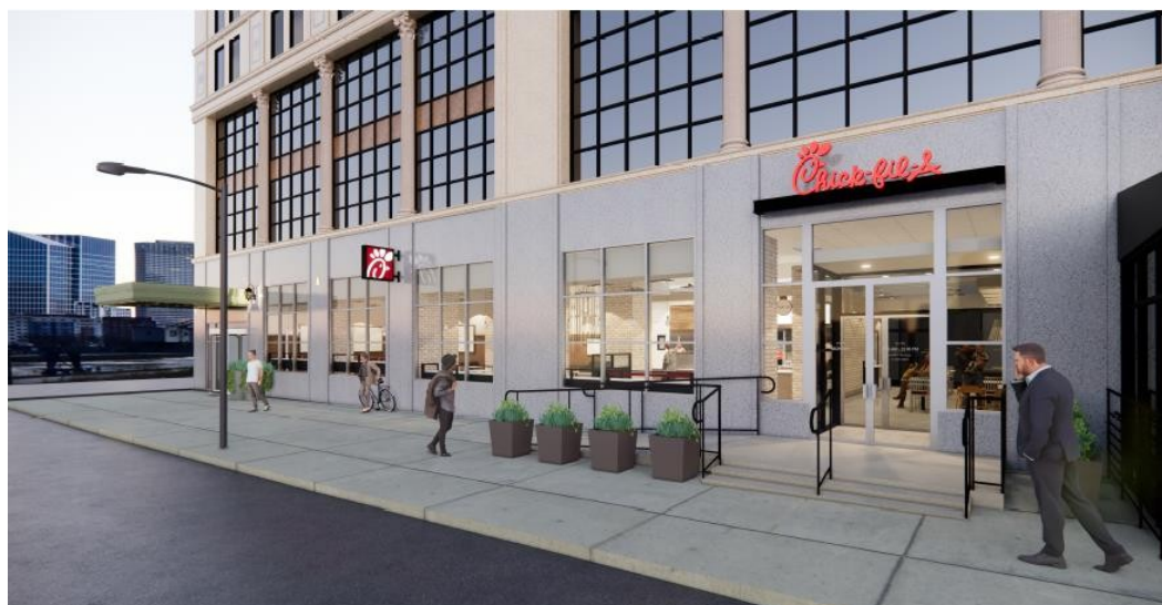
Rendering of proposed alterations