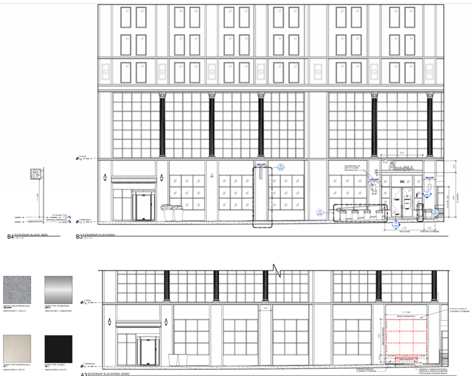
From drawing set Elevations