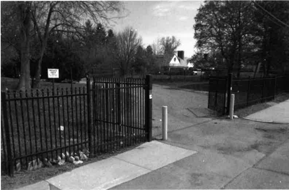
FAIRWAY DRIVE & W. MCNICHOLS ROAD STREETVIEW