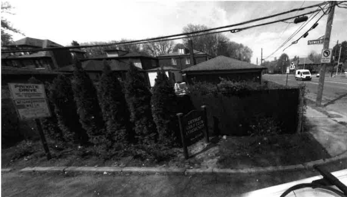
FAIRWAY DRIVE & W. SEVEN MILE ROAD STREETVIEW