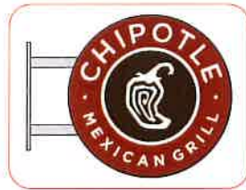
2' D/F Projecting Blade Medallion