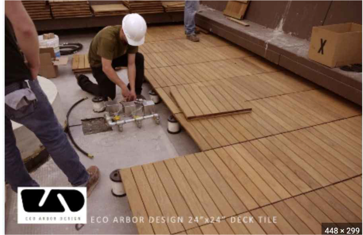
1 DECK TILE PEDISTAL SYSTEM REFERENCE IMAGE