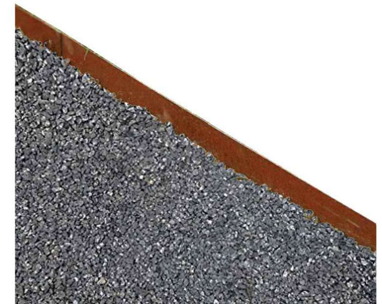
2 DECOMPOSED GRANITE AND CORTEN EDGING- REFERENCE IMAGE