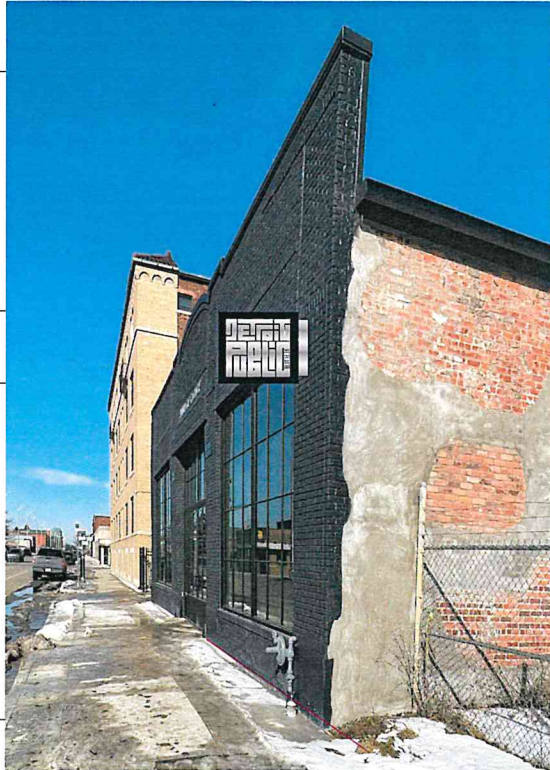
Simulated Perspective View