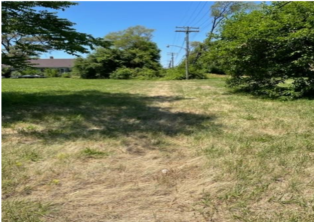
Standing on Jackson looking north onto the park site/alley ROW. As you can see grass has grown over the concrete.