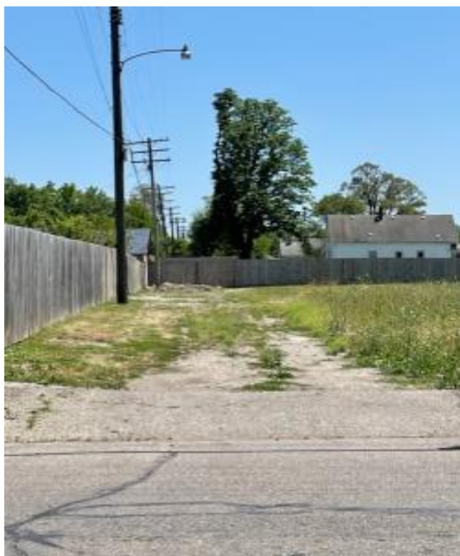
On Buchanan looking south. Note, homeowner has closed off this portion of the alley with a fence.