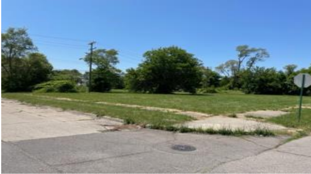
Standing in the intersection of Jackson/Junction looking Northeast at park site

Public records indicate that there is a total of 61 parcels abutting the alley. The ownership of these parcels includes: