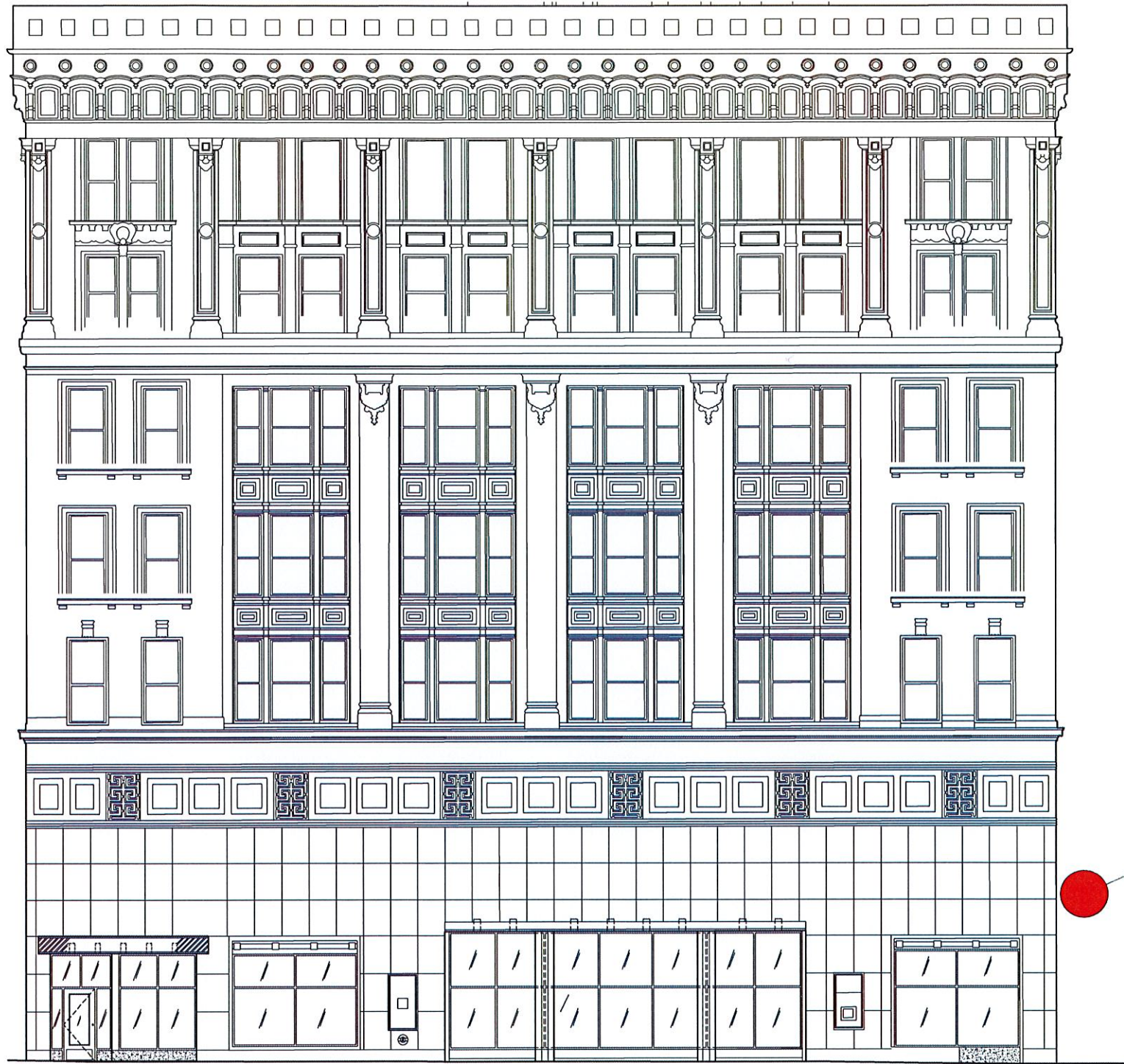
NORTH ELEVATION - (GRAND RIVER AVE)