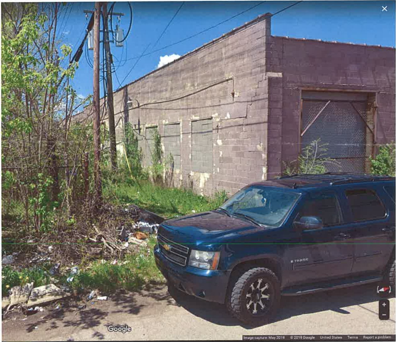
EXHIBIT B – ALLEY PHOTO

32500 PLUMWOOD STREET, BEVERLY HILLS, MI 48025