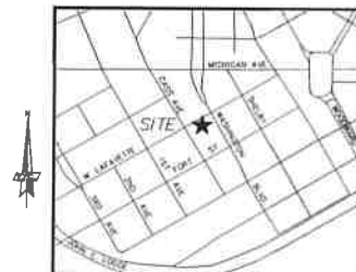
LOCATION MAP ( NOT TO SCALE )

KraemerDesignGroup Architect 800 Broadway / Detroit, MI 48226 | (313) 962-5099 | (313) 962-5055 www.kraemerdsg.com