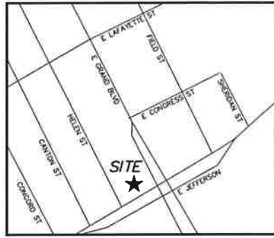
LOCATION MAP ( NOT TO SCALE )