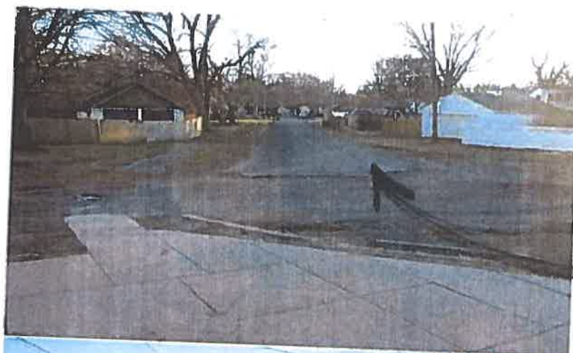
Looking south onto Albert St from our Southwest parking lot