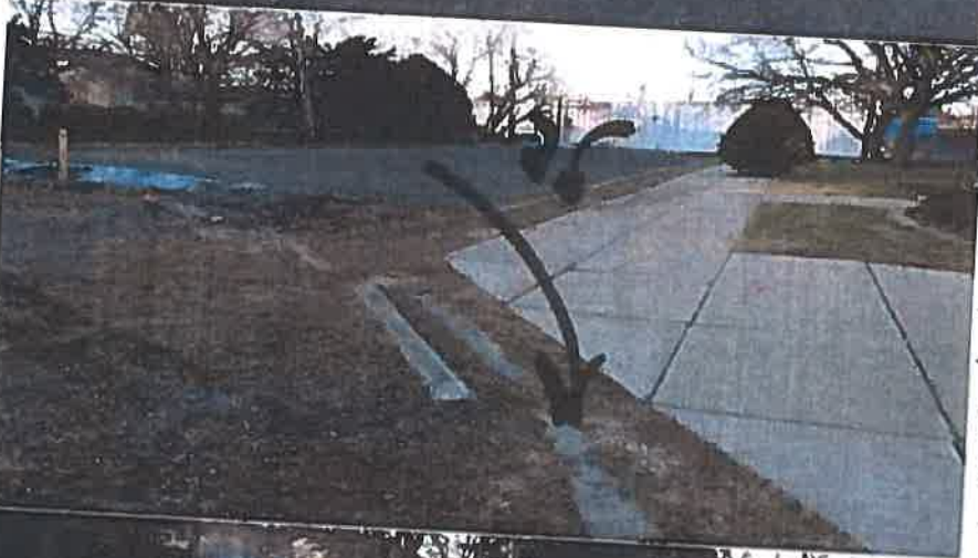
LOOKING @ THE NW PARKING LOT, THIS IS WHERE UNKNOWN DRIVERS DRIVE ONTO TO THE SIDEWALK TO CUT THROUGH - FROM THE ALLEY-WAY TO THE CSU PARKING LOT TO GET TO SIDE STREET, (SALEM'S FIVE POINTS ST)