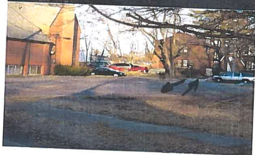
Driveway easement from Salem St heading into the southwest parking lot