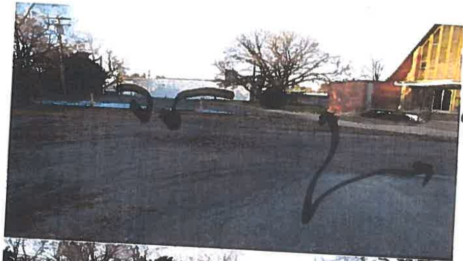
STANDING IN THE SOUTHWEST (SW) PARKING LOT, LOOKING AT THE NORTHWEST PARKING (NW) PARKING LOT