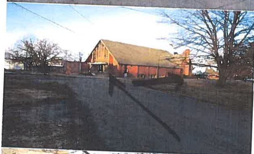
Looking north from Albert St. heading into the southwest parking lot (Five Pointes St.) is directly behind me, taking this photo