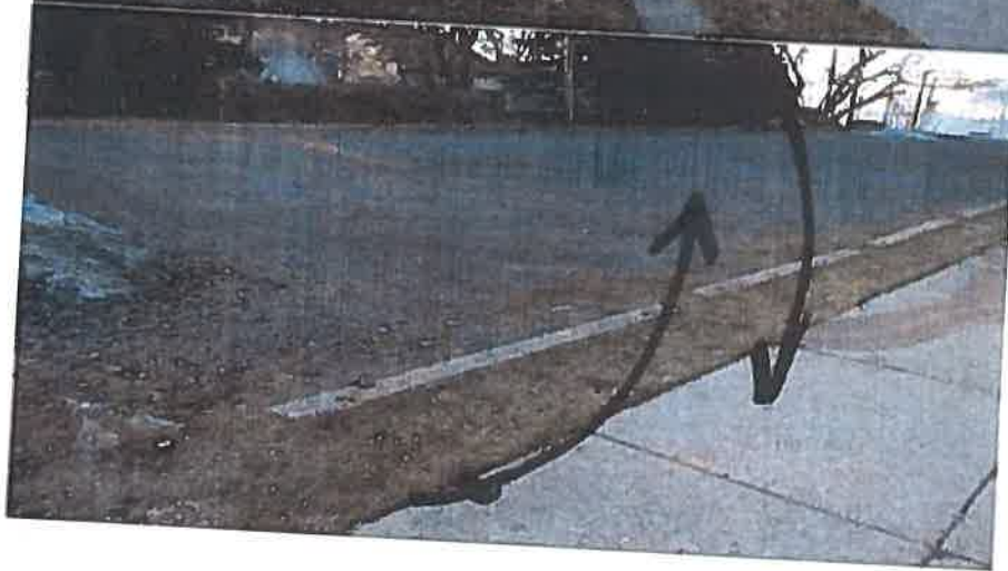
CLOSE UP VIEW OF THE NORTHWEST PARKING LOT