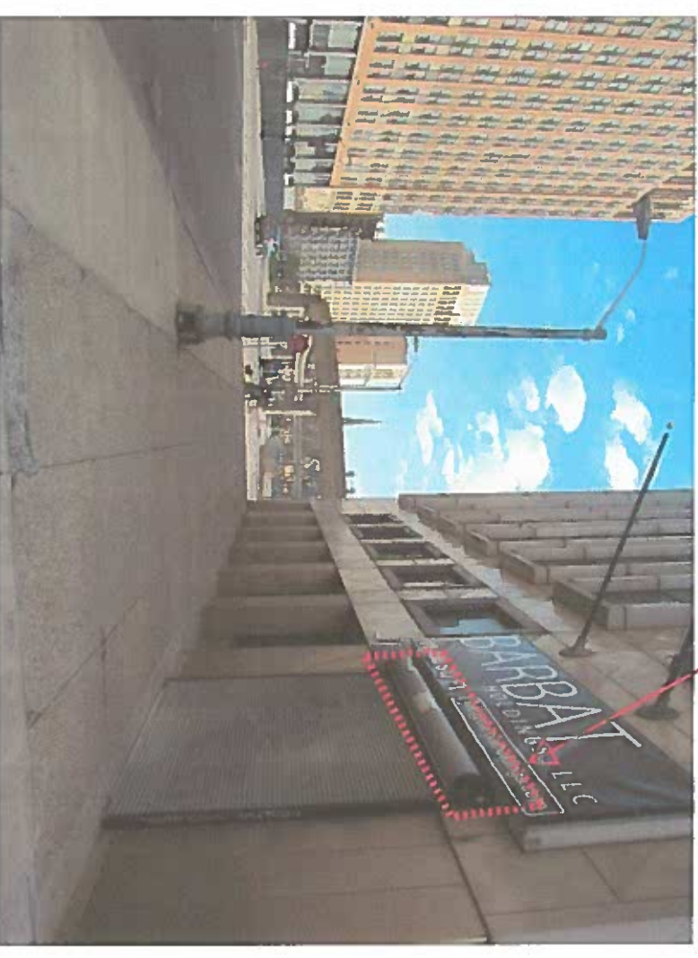
VIEW NORTHEAST UP BAGLEY AVE ALONG EXISTING ENTRY