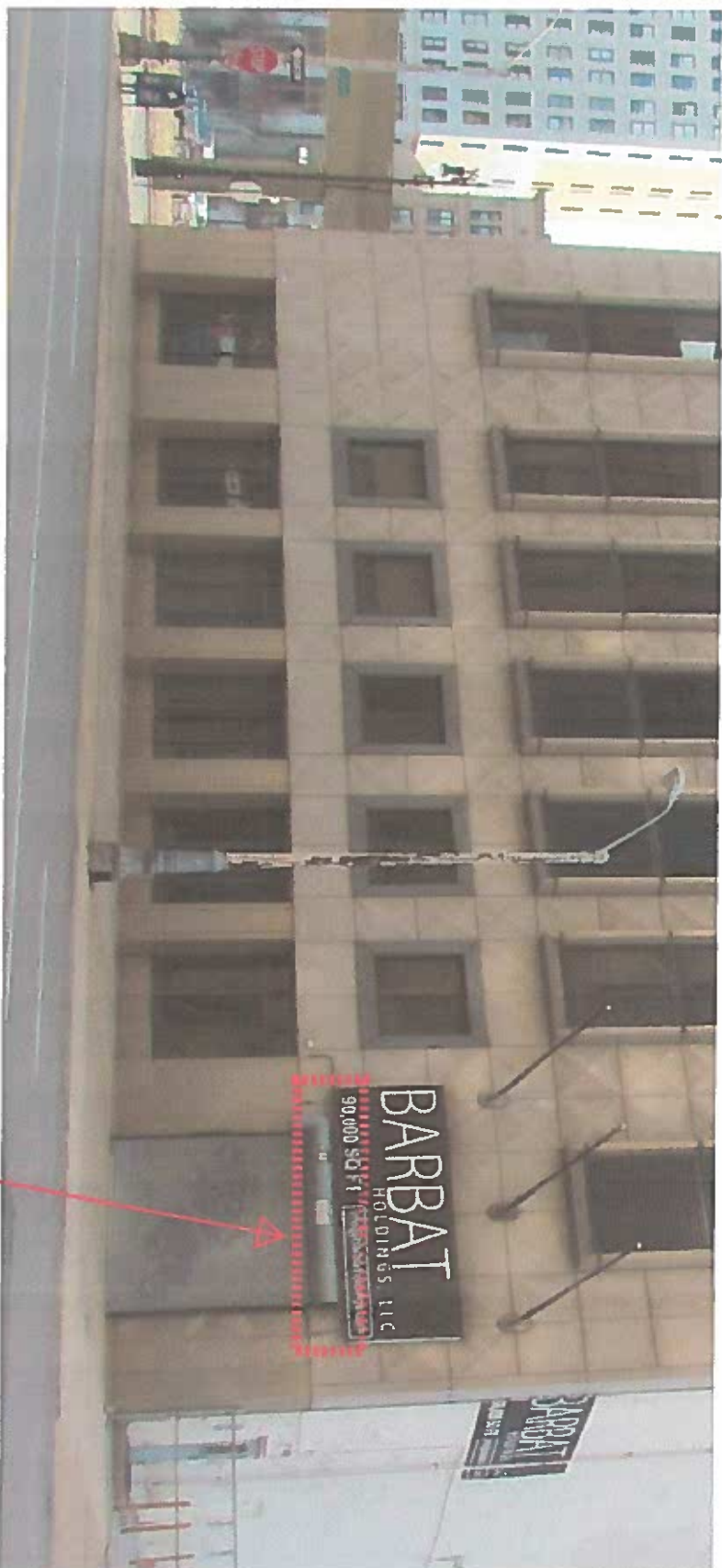
VIEW EAST TOWARDS EXISTING PHILLIPS HOUSE ENTRY