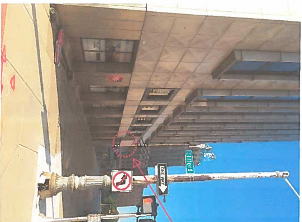
VIEW SOUTH TOWARDS EXISTING PHILLIPS HOUSE ENTRY