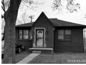
Item 1 of 2 1 Image / 1 Sketch