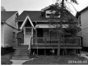
Item 1 of 2 1 Image / 1 Sketch