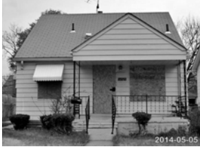
Item 1 of 2 1 Image / 1 Sketch