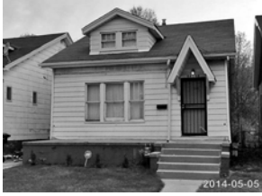
Item 1 of 2 1 Image / 1 Sketch