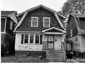
Item 1 of 3 2 Images / 1 Sketch