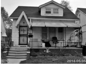
Item 1 of 2 1 Image / 1 Sketch