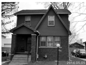
Item 1 of 2 1 Image / 1 Sketch