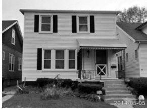
Item 1 of 2 1 Image / 1 Sketch