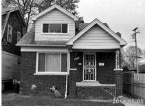
Item 1 of 2 1 Image / 1 Sketch