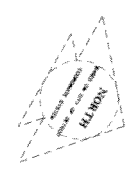
CARTOGRAPHIC MAP NO. 29-E

CITY OF DETROIT CITY ENGINEERING DEPARTMENT SURVEY BUREAU JOB NO. 01-01 DRAWING NO. X-XXX.DGN