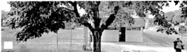
1683 Elsmere St Detroit, MI 48209