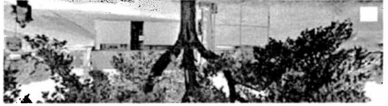
1683 Eismere St Detroit, MI 48209