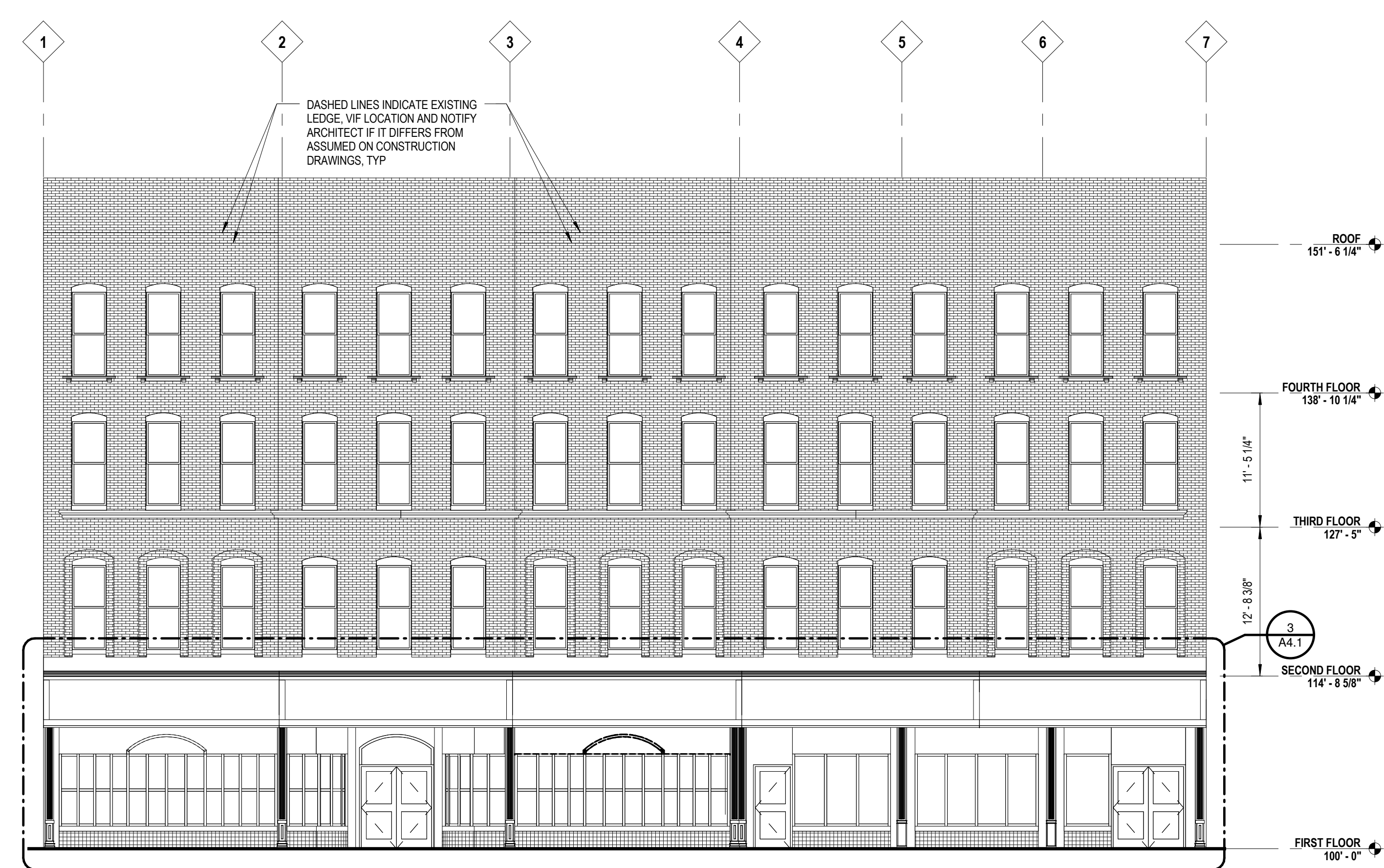
1 WEST ELEVATION - DEMOLITION 1/8" = 1'-0"