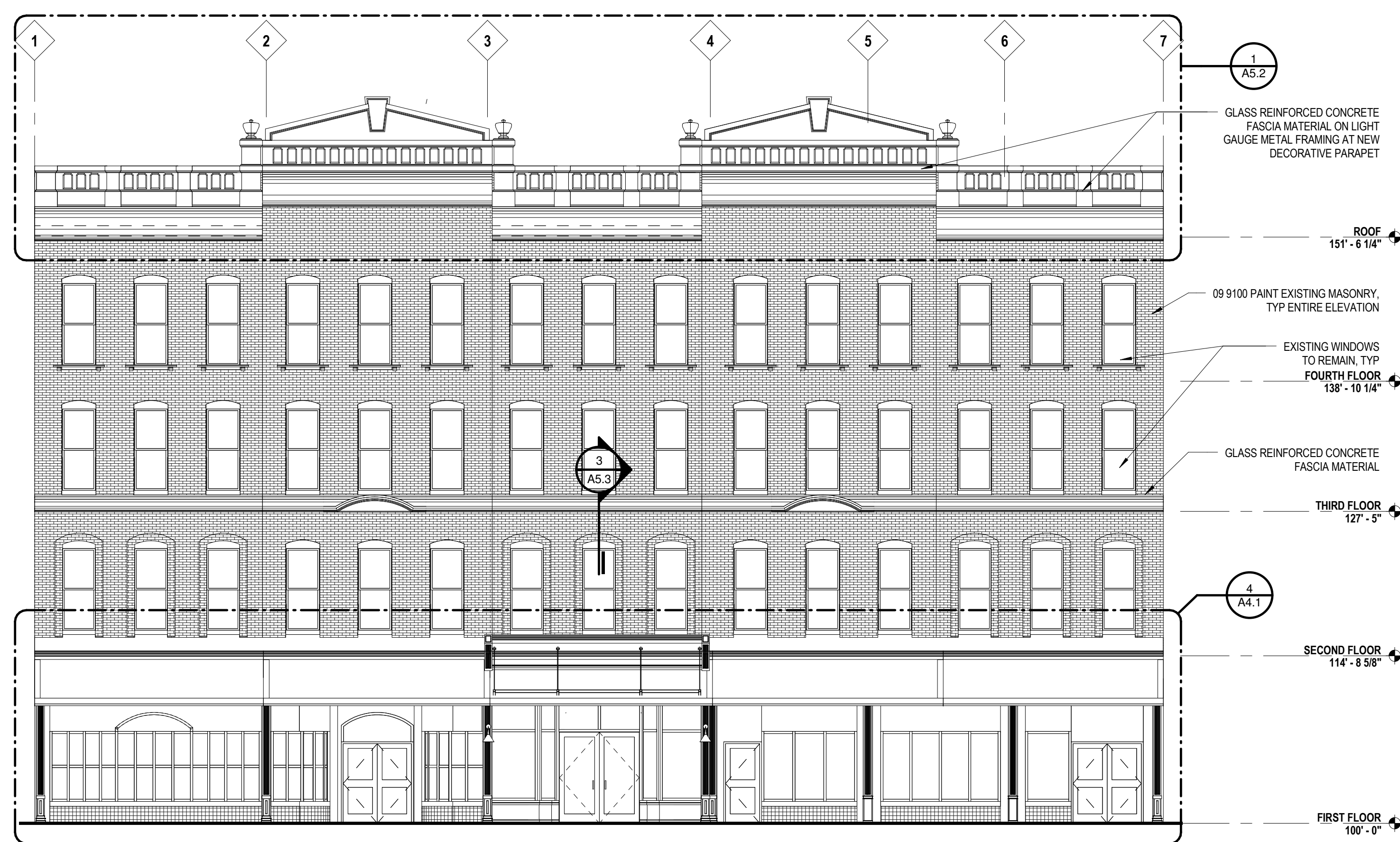
2 WEST ELEVATION - NEW WORK 1/8" = 1'-0"