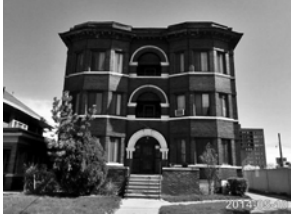
Item 1 of 3 2 Images / 1 Sketch