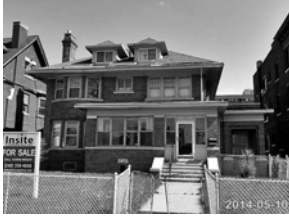
Item 1 of 3 2 Images / 1 Sketch