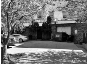
Item 1 of 1 1 Image / 0 Sketches