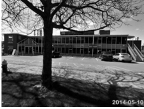
Item 1 of 2 1 Image / 1 Sketch