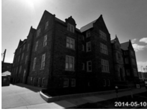
Item 1 of 3 3 Images / 0 Sketches