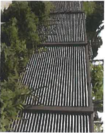
Aluminum Fence Example