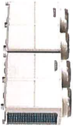
12' long HP- 65 DBA