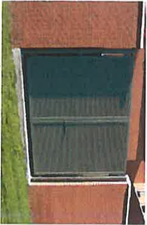
Aluminum Gate Example