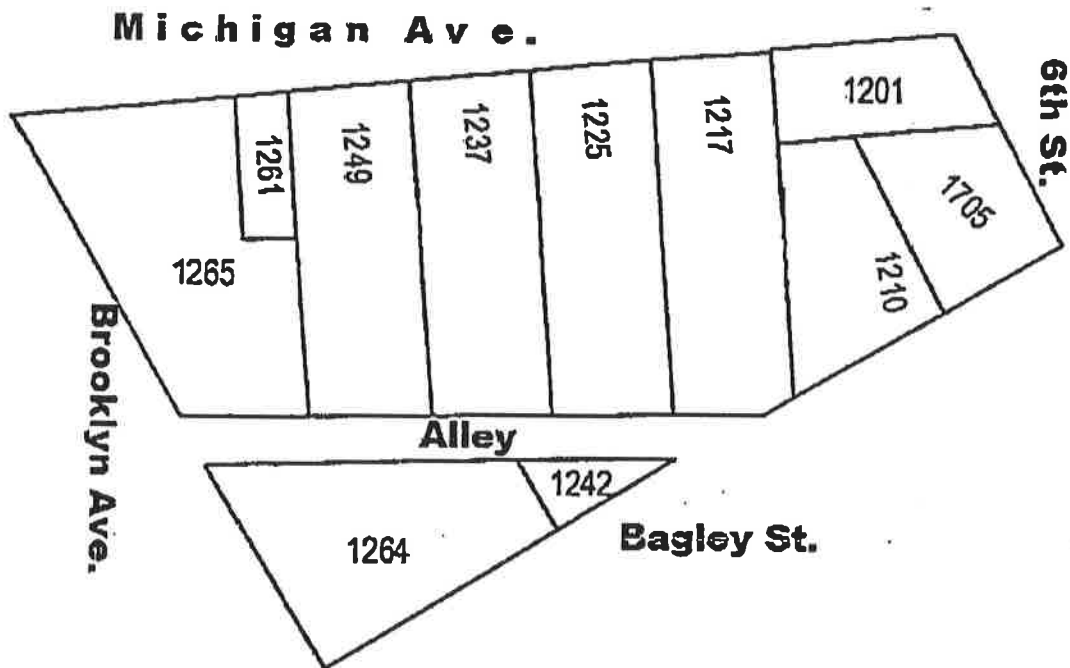
BLOCK 57 OF THE LABROSSE FARM