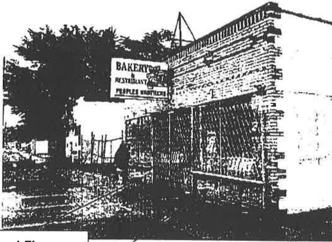
Proposed Flower Planter Locations