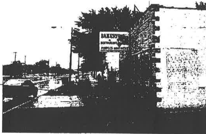
Dimensions: 2ft x 2ft x 4ft