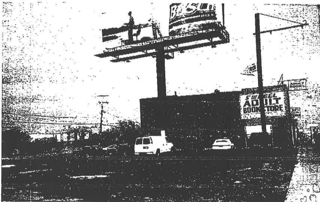
PHOTO 2: 9394 MICHIGAN AVENUE. THE BOOK STORE IS NOT IN- CLUDED IN THE SUBJECT PROPERTY.