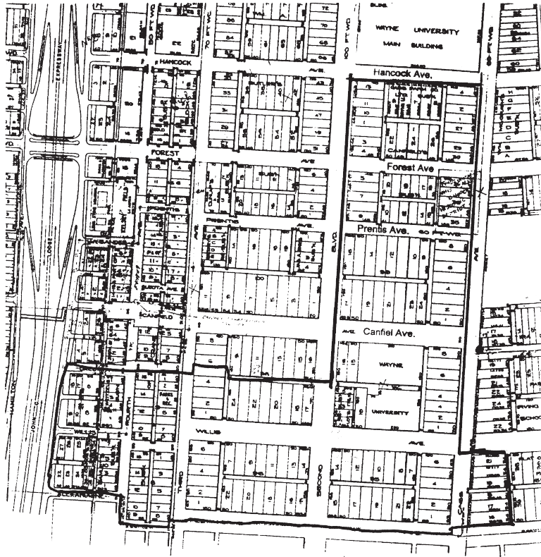
Midtown Group NEZ