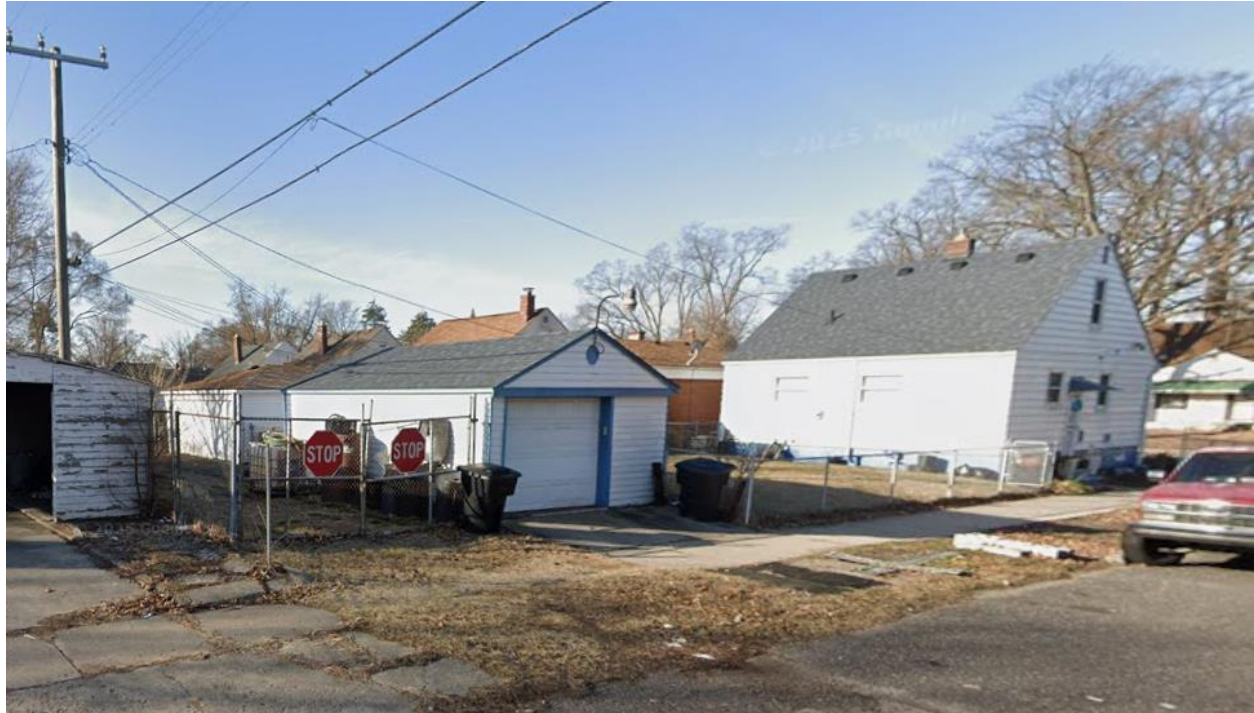
Attachment: Image of fence obstructing the public alley.

Phone 313•224•3949 TTY: 711 Fax 313•224•3471 www.detroitmi.gov