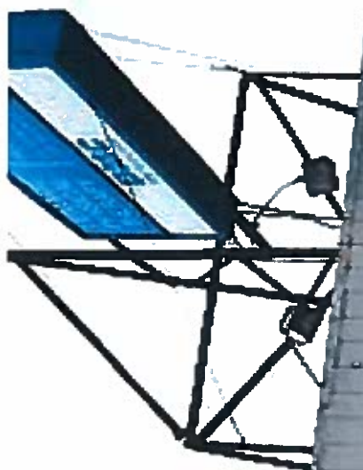
Exhibit A 18663 Livernois... Alky in rear to be Maintained