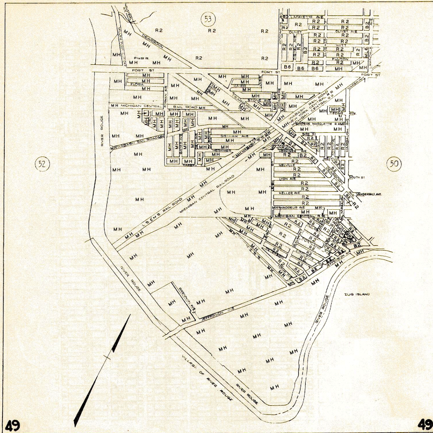
DISTRICT MAP 49