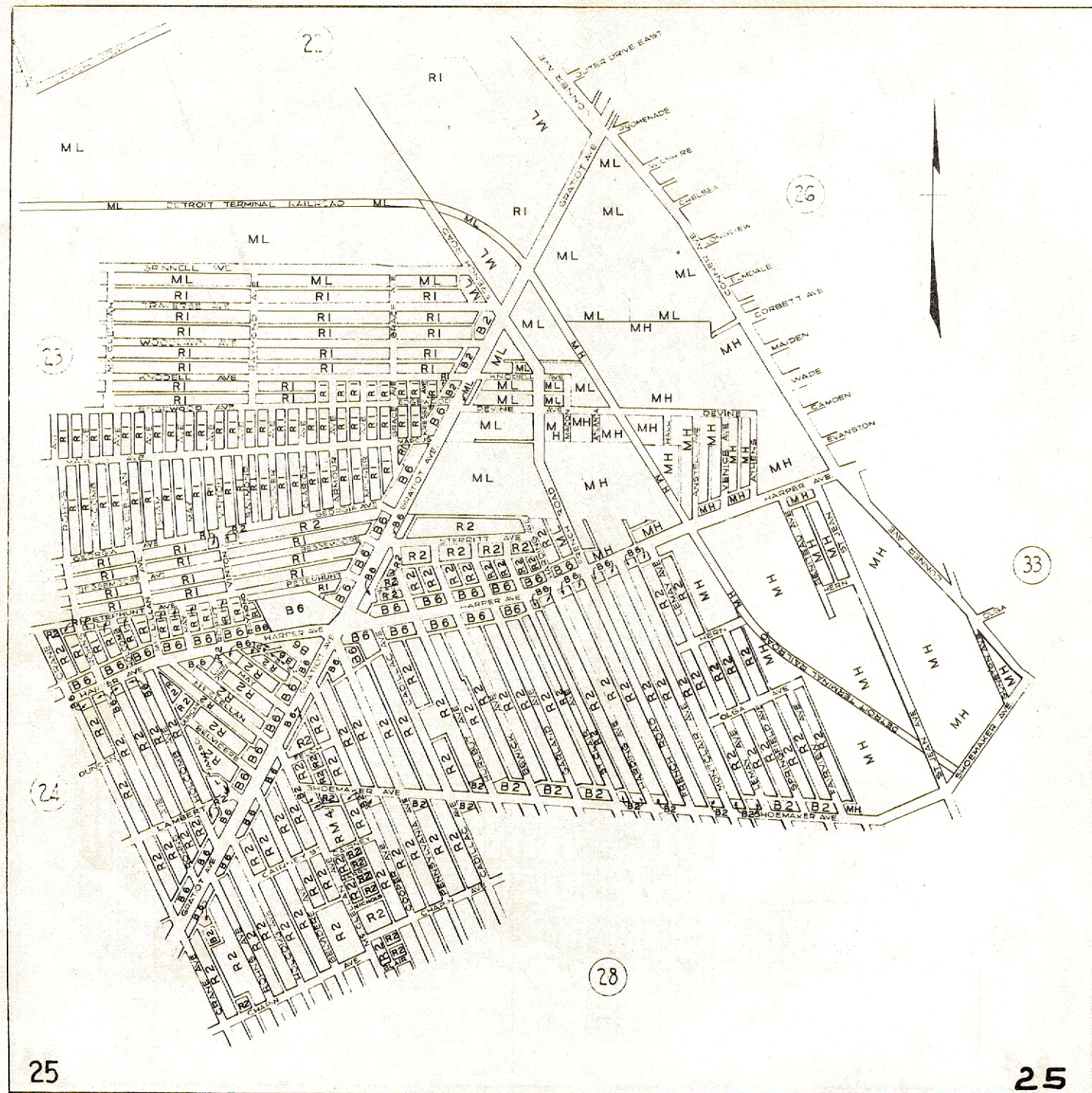
DISTRICT MAP 25

yards entirely enclosed within a building, having enclosing walls on all sides, power and heating plants with fuel storage, laundries, bakeries, dry cleaning and carpet cleaning plants and other similar buildings and uses.