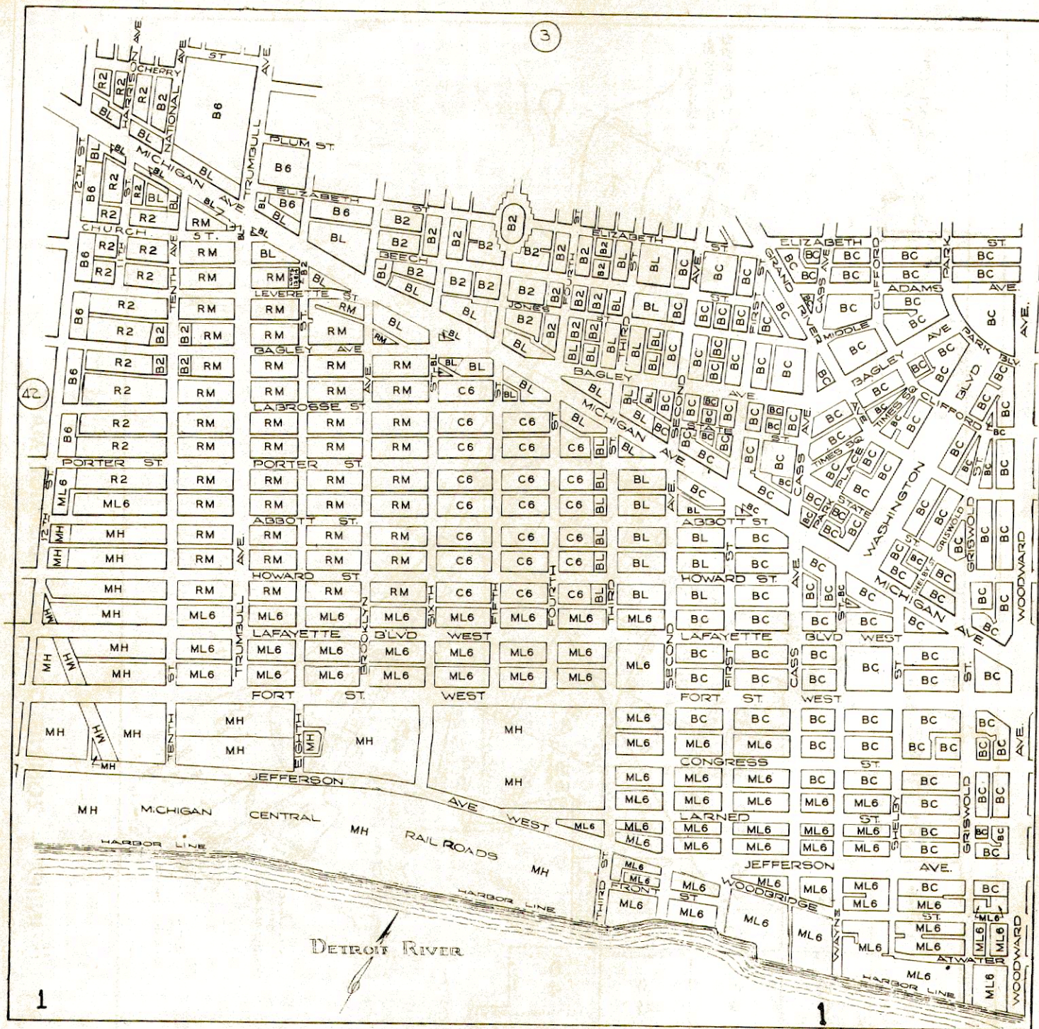
DISTRICT MAP 1