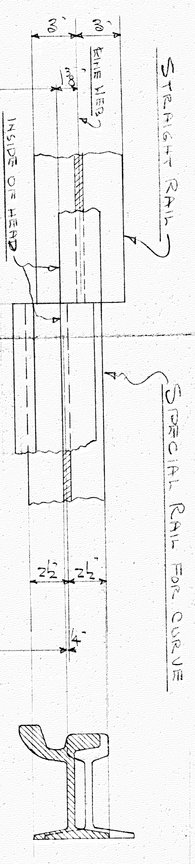
PLAIN VIEW OF RAILS AT SPACE SCALE: 3\"/>