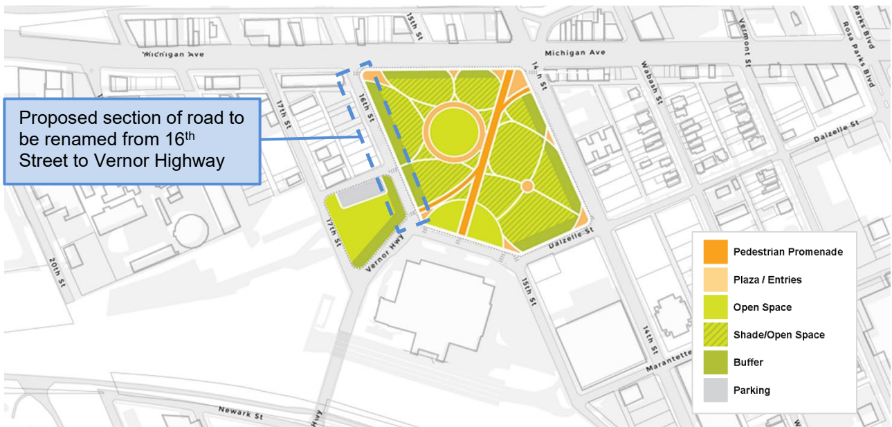
Exhibit 2: Boundaries of proposed street renaming